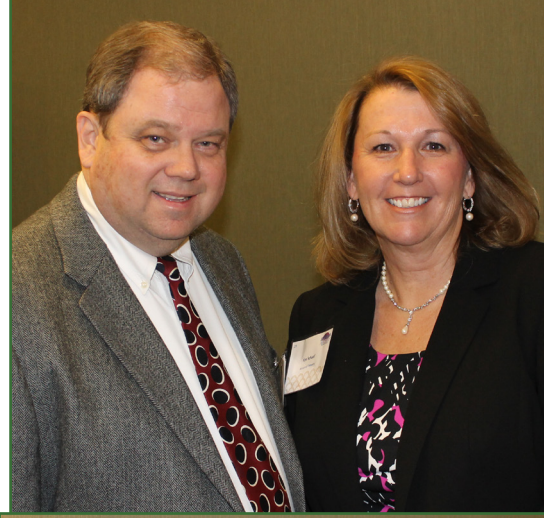
Annual Dinner Celebration